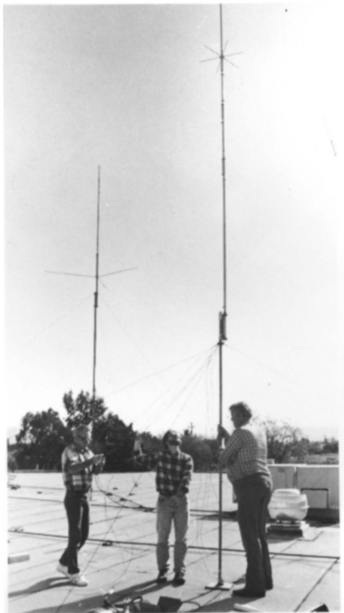
Above (l to r) WA6WST, WB6YRU AND KC6WMM deploy the radials for the Hustler 4BTV at the Red Cross.